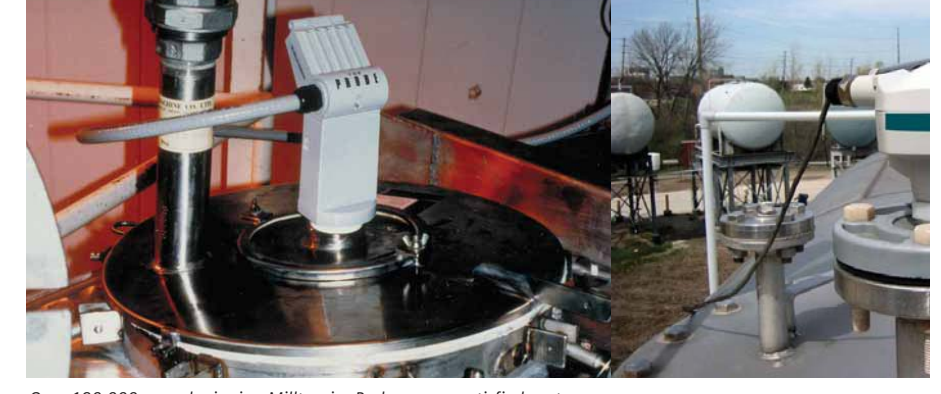
Over 190,000 award-winning Milltronics Probes serve satisfied customers worldwide in many applications. Now, Siemens Milltronics has taken The Probe to a higher level, combining experience with nineteen patented technologies to give you the ultimate reliability in level measurement.