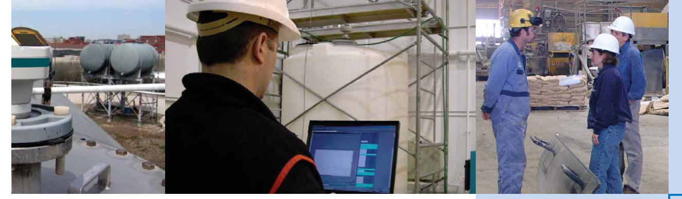
SITRANS Probe is easily programmed with SIMATIC Process Device Manager (PDM), the ideal software tool for configuration, parameter setting, record keeping, and diagnostics, including trending and echo profiles. PDM offers communications via HART, PROFIBUS, and other protocols.